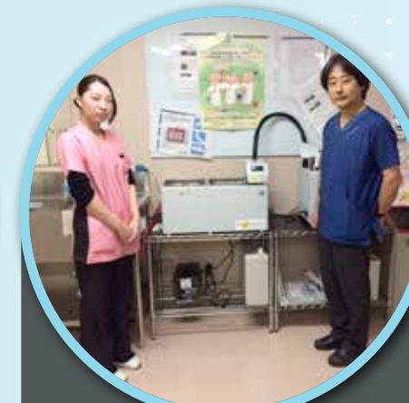
Tokuyama Central Hospital, Japan