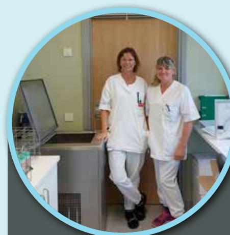
Haukeland Universitetssjukehus, Norway