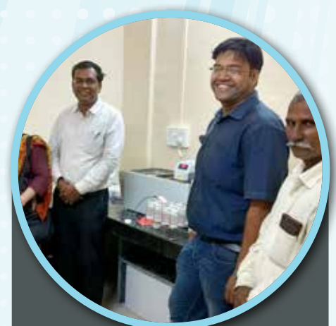
GWC Hospital Akola, India