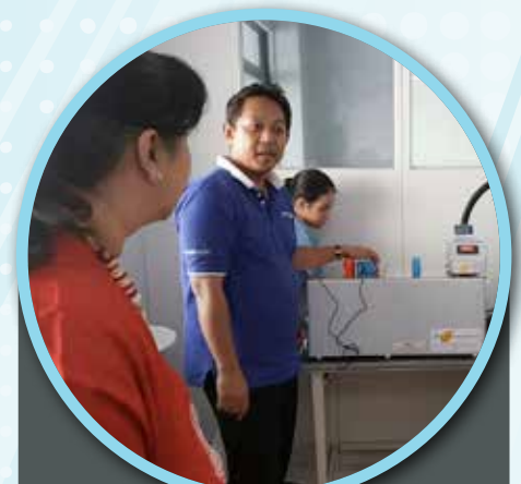
RSUPM Hospital Jakarta, Indonesia