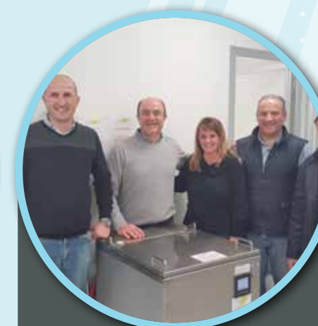
Clinica Mangiagalli Milan, Italy