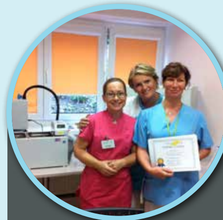
Opole Hospital, Poland

Sterifeed would like to welcome their new customers from around the globe - still leading in Human Milk pasteurisation around the world